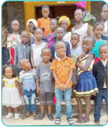
School Tuition for Orphans