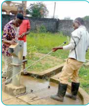
Water Pump Replacement