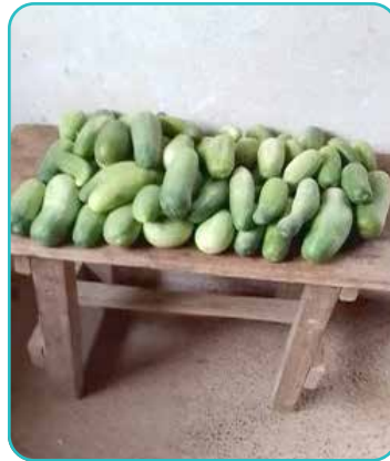
Fertilizer and Farming Supplies