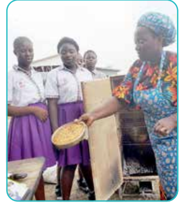
Oven for Baking Food for our Students