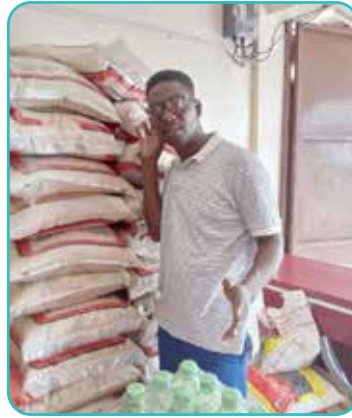
Food and Clean Water for Orphans