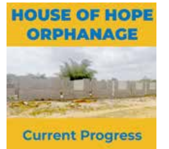
HOUSE OF HOPE ORPHANAGE