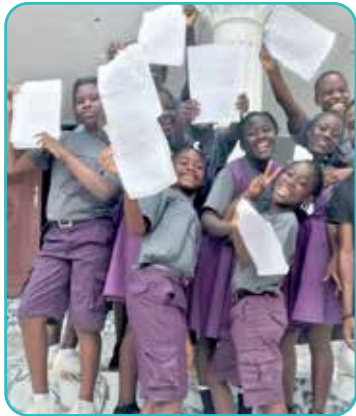
Exam Fees for Students from Blind Community