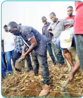
Training for Farmers