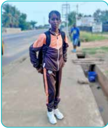
Exam Fees for a Widow's Daughter