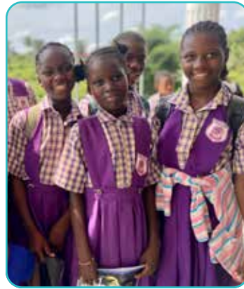
Education for Students