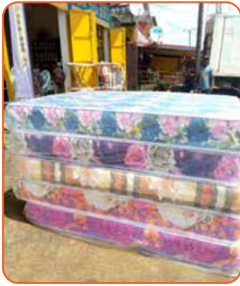
Mattresses for Orphans