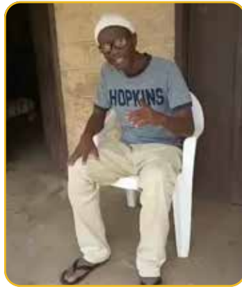
Medical Treatment for Tuberculosis