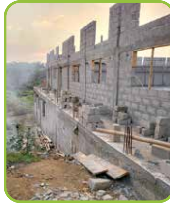
Living Faith Gospel Center

We have been thrilled to partner with this dynamic young pastor who has a vision to bring the gospel to new and unreached areas. The Lord put it on his heart to buy a piece of land that had been used for the past 50 years to practice dark magic and voodoo. The land has been purchased and redeemed, and now a beautiful new church building is being built on that property, to the glory of God.